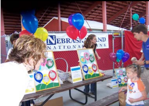
NebraskaLand National Bank hosted a booth at the NEBRASKALAND Days kids fun fest. Children could win prizes by participating in the bean bag toss.